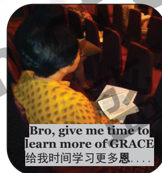
Bro, give me time to learn more of GRACE 给我时间学习更多恩...