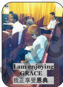
I am enjoying GRACE... 我正享受恩典..