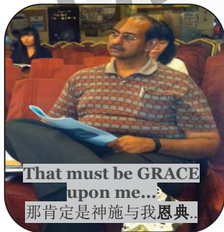
That must be GRACE upon me... 那肯定是神施与我恩典..