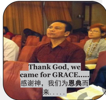
Thank God, we came for GRACE.... 感谢神，我们为恩典而 来....